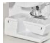
Free arm/Flat bed convertible sewing surface