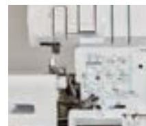
4 colour easy threading guide